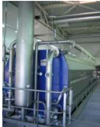
MEURA 2001 Hybrid ILOBOX MEURACLEAN